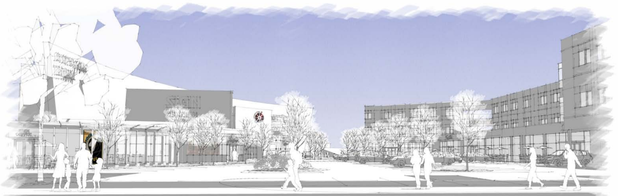
Illustrative Scheme views and images

St Stephens Place, Trowbridge September 2011