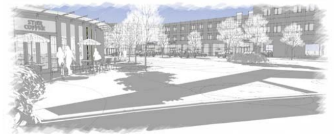
Illustrative Scheme views and images