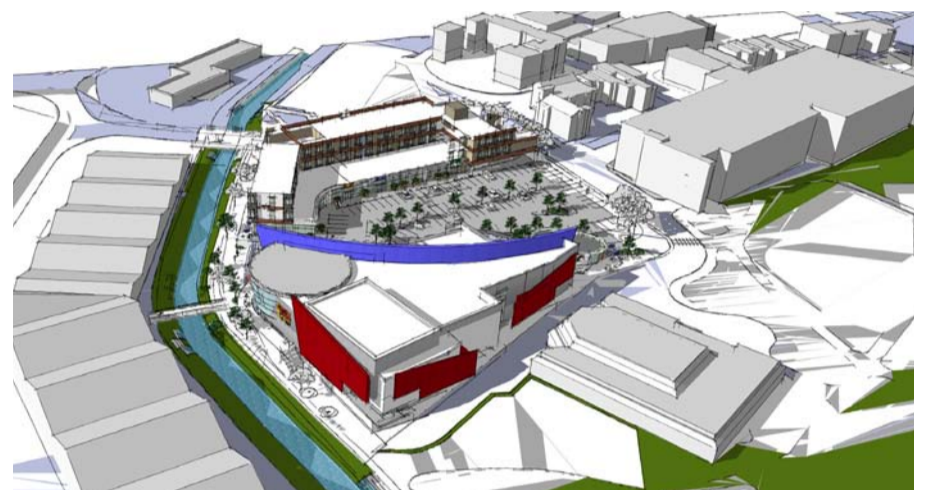
Illustrative Scheme views and images